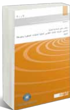
IFRS for SMEs