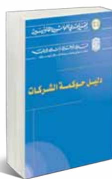
A Guide to Corporate Governance (English version)