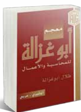
Abu-Ghazaleh Accounting and Business Dictionary