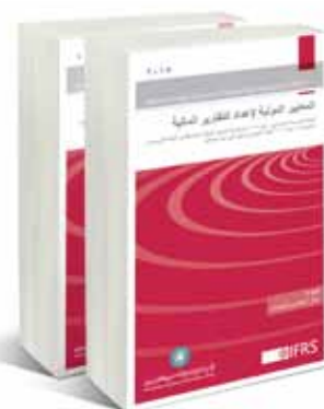
International Financial Reporting Standards 2015 (2 parts)