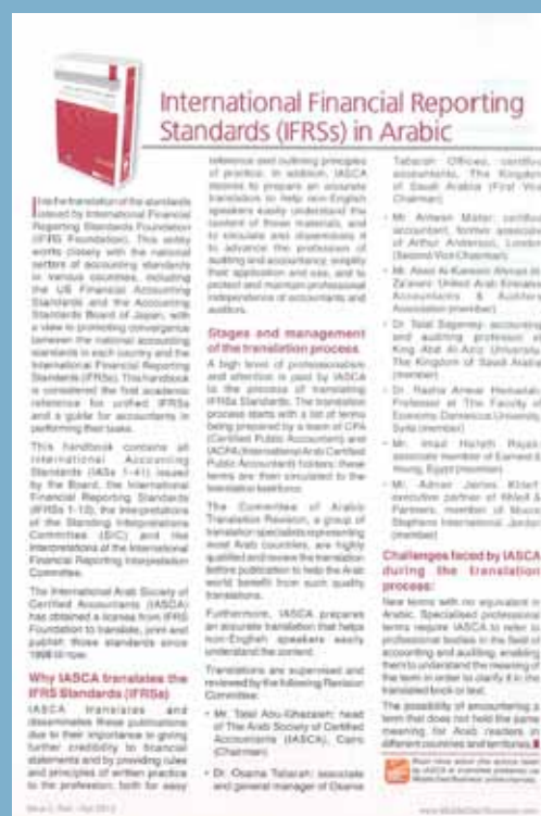
Clipping of the Middle East Business Magazine article