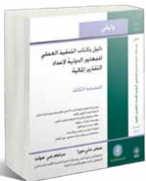
International Financial Reporting Standards – Practical Implementation Guide and Workbook (Wiley) 2011