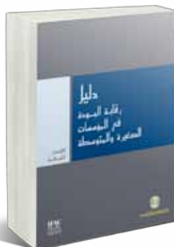
Guide to Quality Control for Small- and Medium-Sized Practices