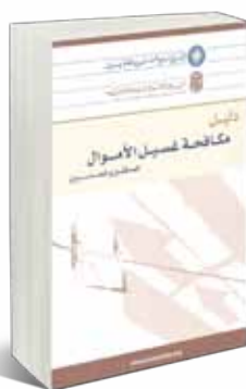
Anti-Money Laundering Guide (English version)