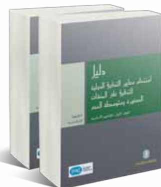
Guide to Using ISAs in the Audits of small- and Medium-Sized Entities, (2 parts)