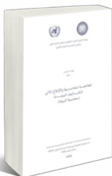
Accounting and Financial Reporting for Environmental Costs and Liabilities