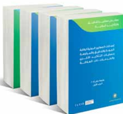
International Quality Control, Auditing, Review, Other Assurance, and Related Services Pronouncements 2014 (4 parts)