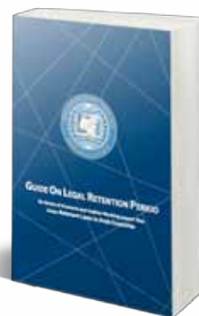
Guide On Legal Retention Period For Books Of Accounts And Auditor Working Papers' Files Under Relevant Laws In Arab Countries