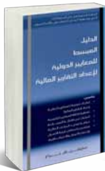
The Vest Pocket Guide to IFRS