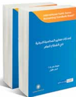
Hand Book of International Public Sector Accounting Standards 2014 (2 parts)